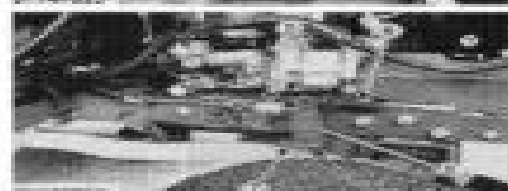
11461-1 1) HST Belt 2) HST Tension Spring 3) Engine Pulley 4) Tension Bracket 5) PTO Tension Spring 6) Return Spring