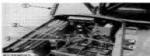
11460-1 1) Grip 2) PTO Clutch Lever