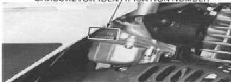
CARBURETOR IDENTIFICATION NUMBER

The carburetor identification number is on the carburetor body right side.