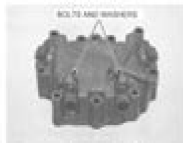
BOLTS AND WASHERS

Remove the retaining bolts and sealing washers.