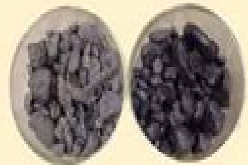
Bitumen Adhesion test