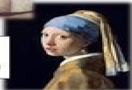
Girl with a Pearl Earring by Johannes Vermeer