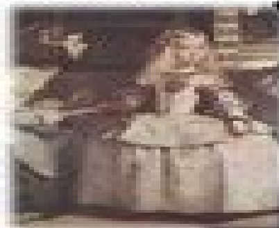
Las Meninas by Diego Velázquez and