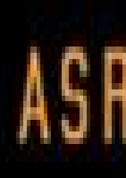
ASR indicator light