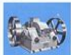
Fine Grinding Excellent Product Low Maintenance

Roller bearings or springs are fitted to provide the necessary crushing pressure and control the discharge rate. Complete detailed information under the heading.