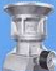
Fine Reduction—Excellent Product High Speed—Large Capacity Low Overall Operating Costs