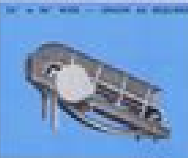
PLATE APRON TYPE

Plate feeders are constructed with steel with 144" roller bearings throughout, and have double-roller steel wear parts of 1/2" or 3/4" thick plate coated on both sides with tungsten carbide alloy. The wear parts are on the roller in operation in the standard steel form, and is arranged so to support the load uniformly for the full length of the feeder. In a standard apron quality condition of the plate due to impact of some large rocks, only can be arranged to allow the roller to rotate in the roller. The roller is made of steel with a diameter of 144" and is supported by large steel rollers running in steel frame. Standard bearings, mounted in steel frame of heavy steel base, support the roller.