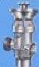
Light Weight but Mighty High Efficiency Low Feed Rates