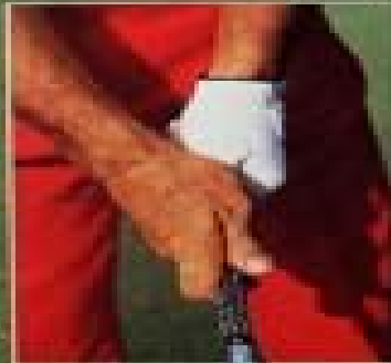
Grip turned too much clockwise