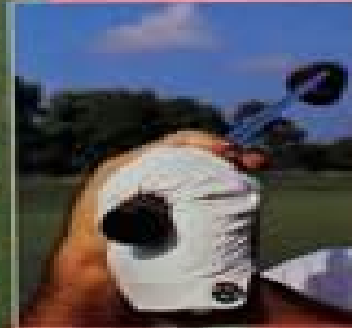
Club face open at the top of the swing