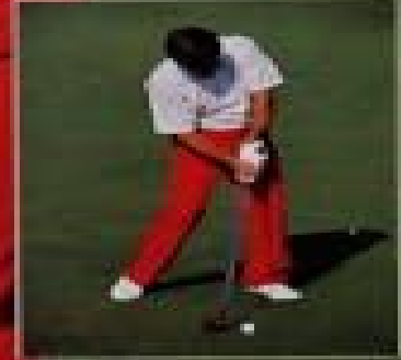
Impact with cupped left wrist and face open