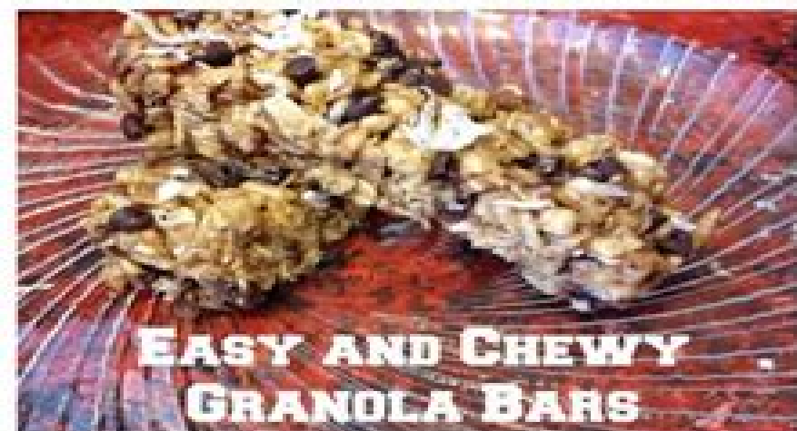
EASY AND CHEWY GRANOLA BARS