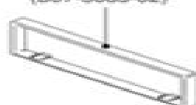
Screw set (N99-1719-05)