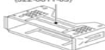
Lever (D10-4589-04) x2