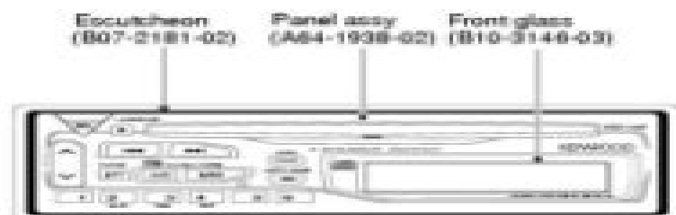
Illustration is KDC-115S.