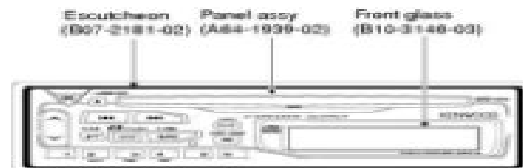
Illustration is KDC-1016.