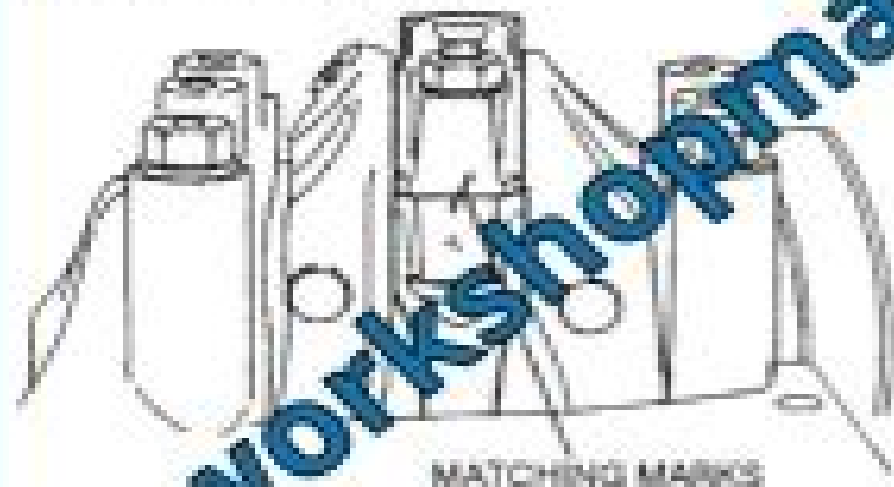
Fig. 10. Aligning the long axis of the connecting rail to cap corners of left and right side sills.