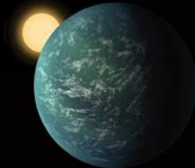
KEPLER-22b DECEMBER 2011