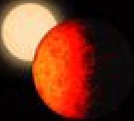
KEPLER-20e DECEMBER 2011