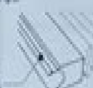
LOCK EDGE SIDE OF SIDE CURTAIN