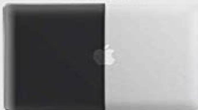
Apple logo OFF