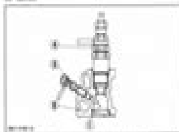
(A) Glow Plug (B) Glow Plug

The cross flow type intake/exhaust ports in the cylinder head have their openings at both ends of the cylinder head. Because the opening between the intake/exhaust ports is less than that of conventional type having all ports on one side, the stream in air is prevented from being forced and expanded by the exhaust gases. The cool, high density suction air has a high volumetric efficiency and raises the power of the engine. Furthermore, clearance of the cylinder head by forced exhaust air is reduced because suction ports are arranged alternately. The combustion chamber is of KUBOTA's unique spherical combustion chamber type. Fuel air is mixed more mixed effectively with fuel, promoting combustion and reducing fuel consumption.