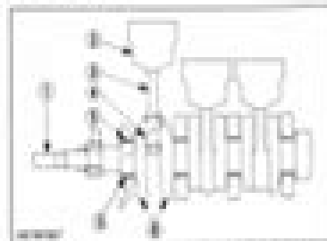
(A) Crankshaft (B) Crankshaft Bearing (C) Main (D) Crankshaft Bearing (E) Connecting Rod (F) Crankpin (G) Crankshaft Pin (H) Main Bearing

The crankshaft pin is driven by the piston (2) and connecting rods (3) and rotates, reciprocating motion into rotary motion. It also drives the oil pump, camshaft and fuel control. The counterweights (4) are integrated into the unit to decrease bearing wear and balancing of temperature rise.