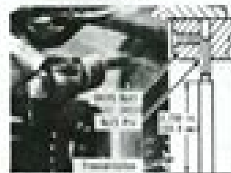
Fig. 39 - View showing pin removal and installation procedure to reset shift rail. When installing, drive pin into rail to depth shown. Refer to text.