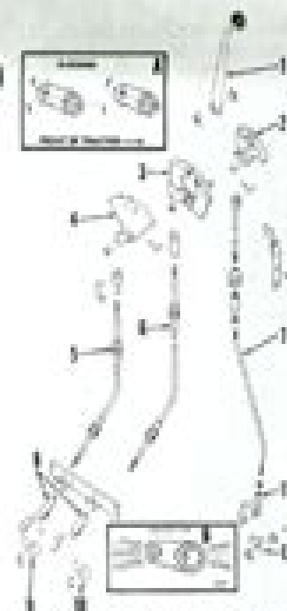
Fig. 37 - Exploded view of four speed shift linkage and park lock linkage on Model 2090 and 2096 (traction as equipped)