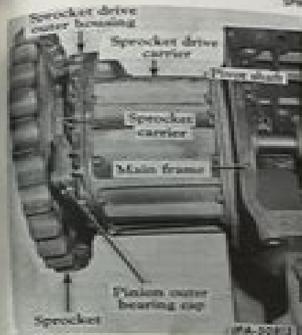
Illustr. 20 - Sprocket and Sprocket Drive Carrier (Wide Tread)

1. Remove the sprocket drive gear (Illustr. 19), and slide the bearing spacer (14, Illustr. 11 or 12), off the pinion shaft.