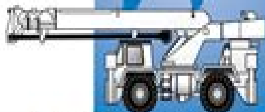
Rough Terrain Hydraulic Crane