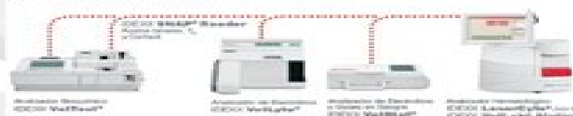
Parte de IDEXX VetLab® Suite

El Analizador IDEXX VetAutoread™ constituye una parte integral de IDEXX VetLab® Suite, una gama de analizadores específicos para veterinarios que ofrecen capacidades de diagnóstico sin precedentes para clínicas y la posibilidad de obtener información consolidada. IDEXX Vet-