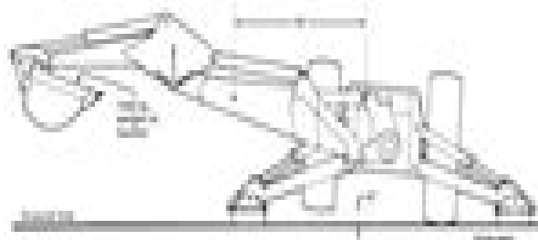
Swing cylinder for swing cylinder test of right side