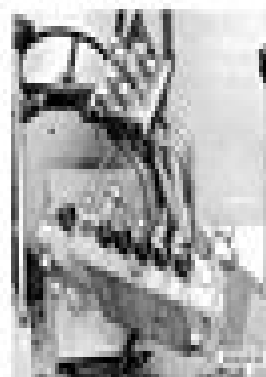
Remove Control Valves on 3400 Loader Tractor

7.11. Remove Backhoe Valves on 3400 Loader application - a lower control arrangement are better illustrated.