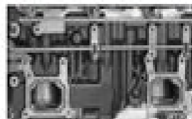
Figure 493 Oil cooler points