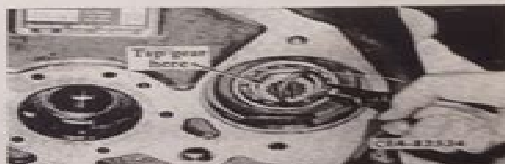
FIG. 27 — Removing the Equipment Pump Accessory Gear Snap Ring