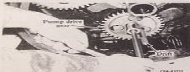
FIG. 24 — Removing the Input Pump Drive Gear Nut