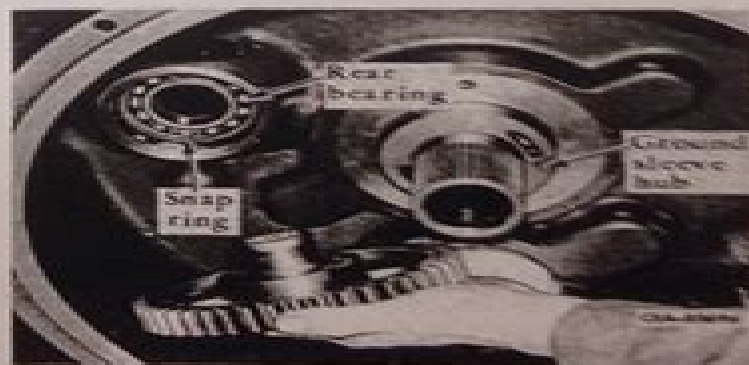
FIG. 28 — Removing the Equipment Pump Accessory Gear