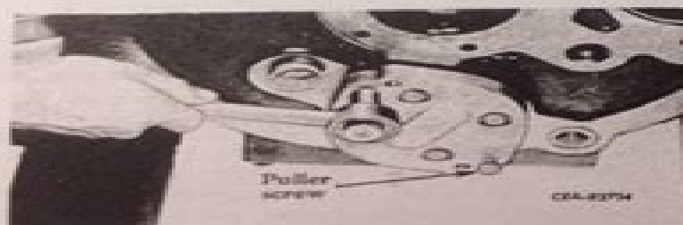
FIG. 25 — Removing the Input Pump