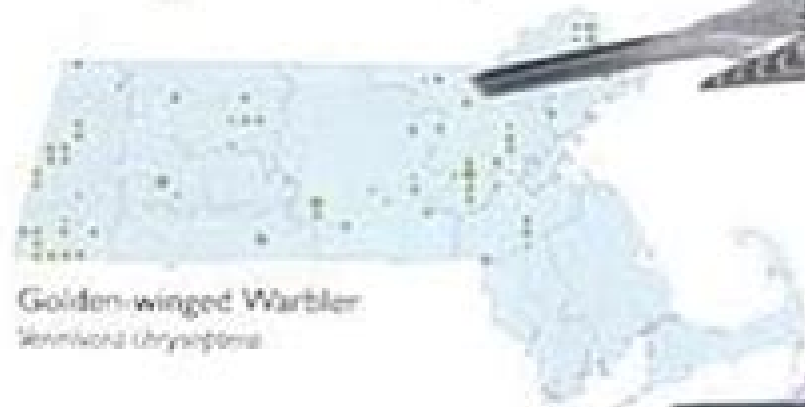
Golden-winged Warbler Geothlypis trichas