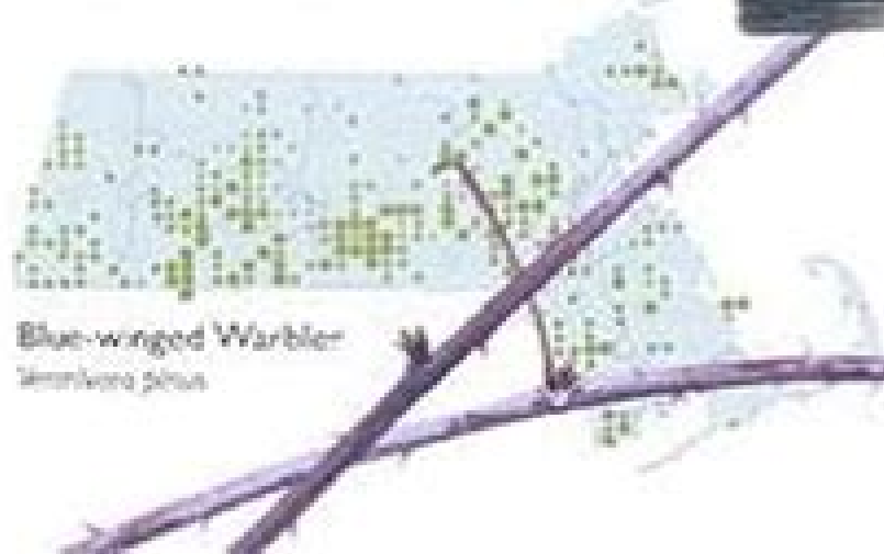
Blue-winged Warbler Geothlypis trichas