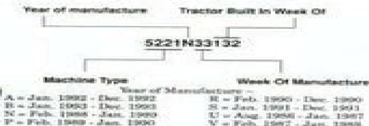
Fig. 3—The tractor serial number identifies machine type, year of manufacture, week of manufacture during specific year, and specific unit manufactured during that week. The illustration shown identifies a two-wheel-drive 360 tractor which was the 132nd tractor manufactured during the 33rd week of 1988.