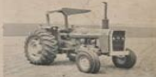
MF 285 TRACTOR 315 engine

Values closed open ball angle acting acting cylinder chamber