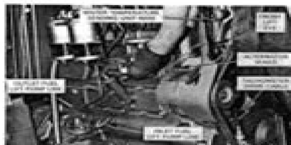
Fig. 5 — Identification of Parts — Right Side of Engine