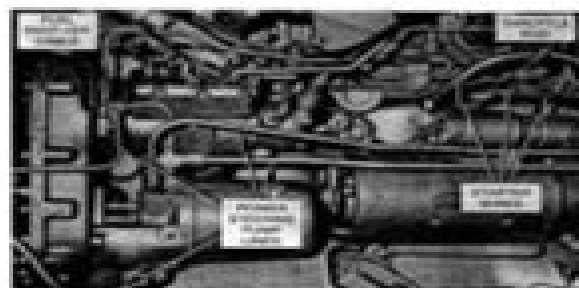
Fig. 4 — Identification of Parts — Left Side of Engine