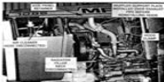
Fig. 2 — Hood Removal or Installation