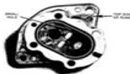
Fig. 2 — Location of Shield and Plate in Front Body