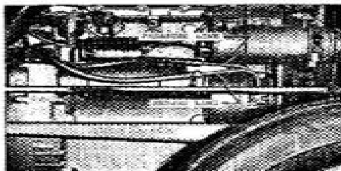
Fig. 1 - Installed View of Engine-Driven Steering Pump - Diesel