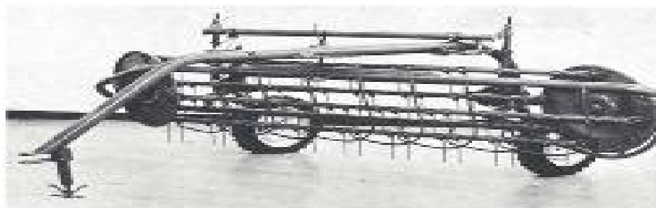
MF 37 SIDE DELIVERY RAKE