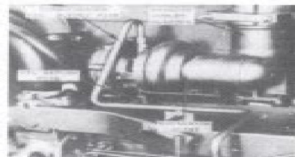
Fig. 90—View showing left side of installed turbocharger.

NOTE: Use care to prevent spacer sleeve from falling out of insert when installing. Install snap ring (19) with BEVELED SIDE OUT. Slide compressor wheel (17) over shaft, coat threads with graphite grease and install nut (16). Use a wrench in vice as shown in Fig. 88 to hold turbine shaft. Tighten nut to 13 ft.-lbs. torque, then spin rotor wheels. The turbine and compressor wheels should spin freely with no rubbing or binding. Disassemble and recheck unit if any binding or rubbing is noted. Reassemble turbine housing (7), clamp (6) and compressor cover (20) making certain that the previously affixed alignment marks (Fig. 81) are in register. Coat threads and back face of screw and nut on clamp (6—Fig. 87) with graphite grease, then torque nut to 10 ft.-lbs. Coat machined flange of compressor cover (20) with graphite grease, and install using the eight special screws (3), lock washers (2) and flat washers (1). Tighten screws (3) evenly to 5 ft.-lbs. torque. Screws attaching oil