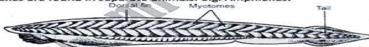
Fig. 10-23: Amphioxus

Q.28: Describe the important characteristics of Agnatha?