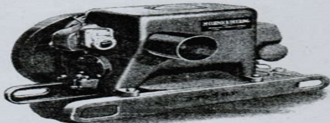
3 to 5 h.p. engine