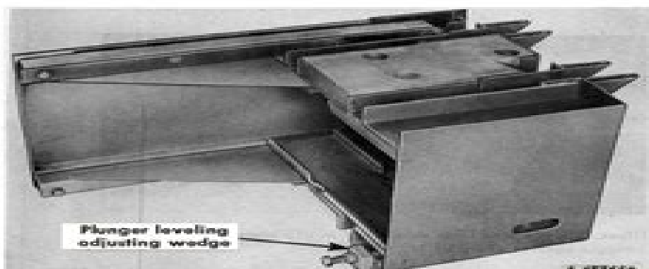
Illustr. 31A - This wedge is used to level plunger so plunger hay knife is parallel to the stationary knife.

With the top and bottom plunger runner guide angles loose, you are ready to adjust the knife clearance.