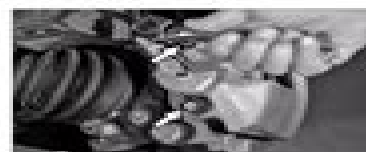
Detailed brake pad and rotor service procedure 46 Brakes-Mechanical