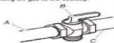
A. Gas supply line B. Shutoff valve "open" position C. To cooktop

The supply line must be equipped with a manual shutoff valve. This valve should be located in the same room but external to the cooktop enclosure or cabinet. It should be in a location that allows ease of opening and closing. Do not block access to shutoff valve. The valve is for turning on or shutting off gas to the cooktop.