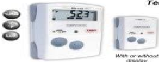
With or without display