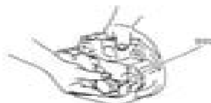
Fig. 67 Installing spring seat (602)