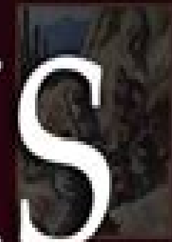
LAST STAND AT PAJARO MILLS