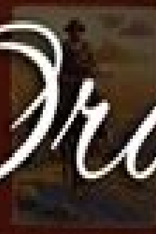
WESTWARD, THE TIDE