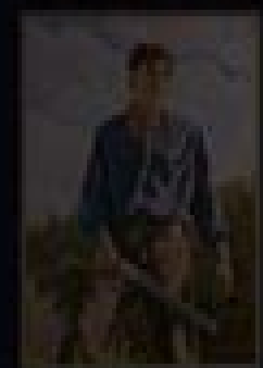
GUNS OF THE TIMBERLAND