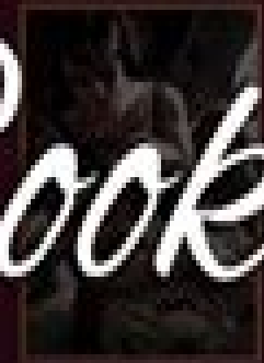
THE BURNING HILLS