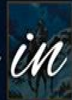
TO TAME A LAND