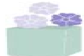
Square or Cube Vase