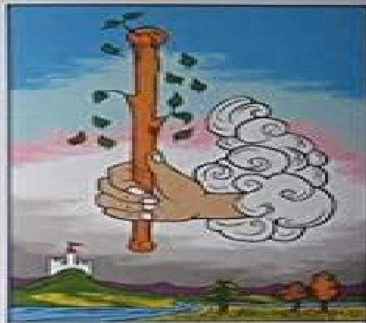
ACE OF WANDS