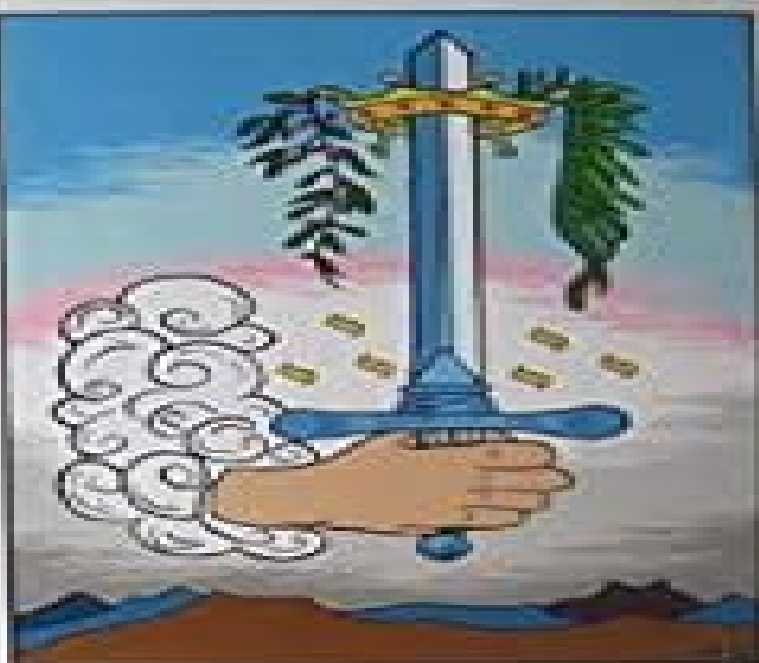
ACE OF SWORDS