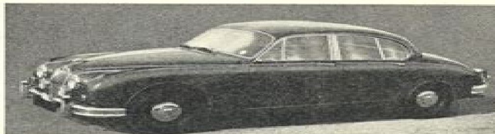
DISTINGUISHING FEATURES. Slender screens and door pillars are fitted on this model, also wide wrap-around screens front and rear. Note foglamp disposition and frontal treatment.

Few special tools are required for service to the car, but those considered essential are listed on p. iii. The templates for use in timing the camshafts will be found in the car toolkit. Threads and hexagons are in the main of S.A.E. pattern and form, but certain proprietary equipment may be found to have threaded parts of British Standard Form.