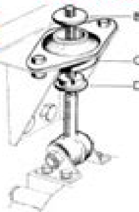
Fig. 40. The engine stabiliser.