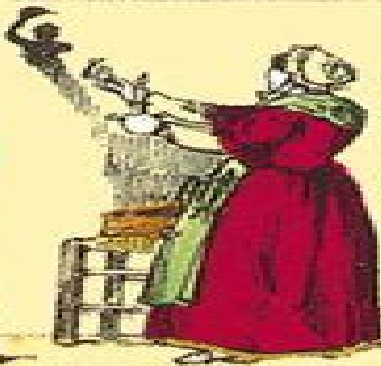
M re de