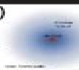
COTTON BALL OR MODERN ATOM MODEL

- according to today's atomic theory, in the electron cloud, electrons whirl around the nucleus billions of times in one second. They are not moving around in random patterns; an electron's location depends upon how much energy the electron has.