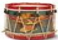
Civil War drum