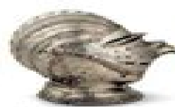
16th-century German eagle helmet