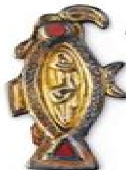
Anglo-Saxon bird brooch