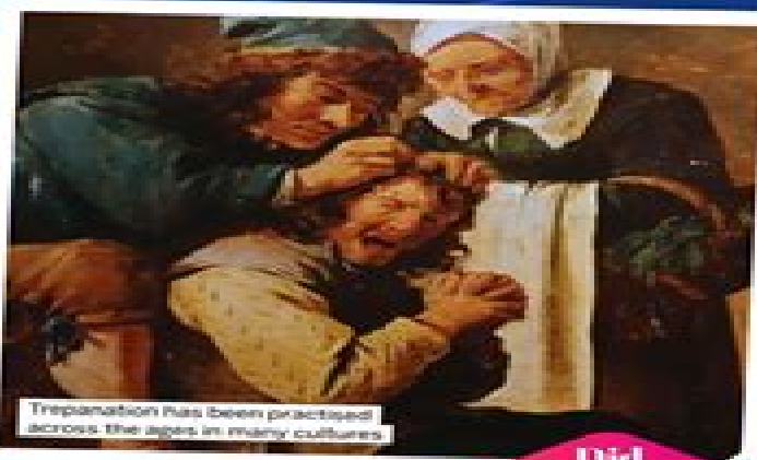
Trepanation has been practised across the ages in many cultures

The process of trepanation was used in ancient times to treat numerous ailments, and over time the skull could heal