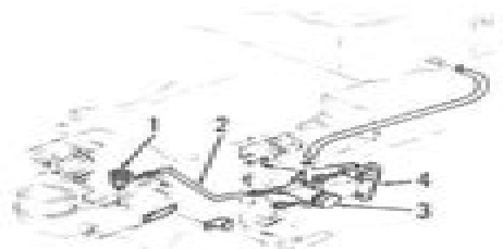
Fig. K3-2—View of fuel primer circuit.

All models are equipped with a pressure lubrication system. The oil drain plug (D—Fig. K1-1) also serves as the oil pickup and a filter screen is attached to end of drain plug. The drain plug and filter should be removed and filter cleaned and oil renewed after every 100 hours of operation.