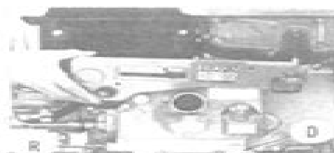
Fig. K1-1—View showing location of oil drain plug (D) and oil pressure relief valve (R).

All engines in this section are liquid-cooled, single-cylinder, four-stroke diesel engines. Crankshaft rotation is counterclockwise from flywheel end.