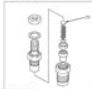
(3) Adjusting member