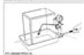
(2) Allowable limit