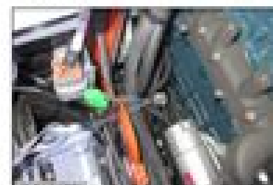
(1) Cabin service