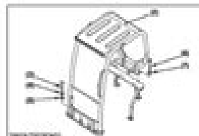
(1) Canopy (2) Bolt (RH) + (LB) + (2) (3) Spring washer + (2) (4) Washer + (2)